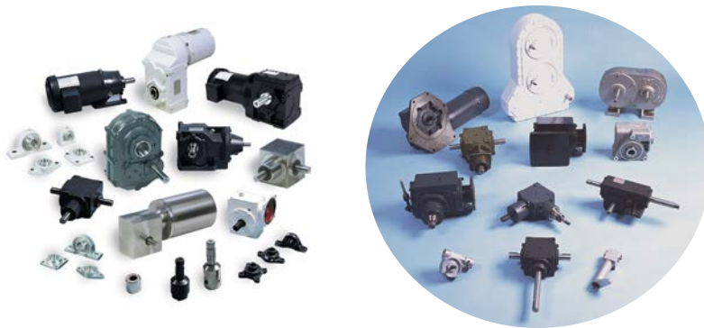
Standard, modified & custom units are built for countless applications.

We know your time is valuable, that's why you can count on us for HUB CITY™ product support, services and solutions to simplify your installation. Select from a complete line of standard, modified or custom HUB CITY product designs.