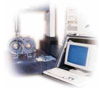
State-of-the-art testing equipment and comprehensive product testing ensures quality.