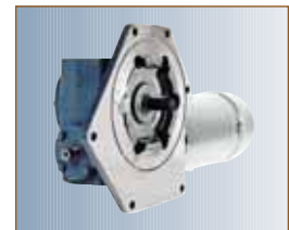
Special Worm Gear Drives