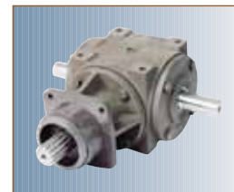
Modified Bevel Gearboxes