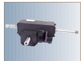
Custom Worm Gear Drive