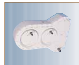
Custom Spur Gear Drives