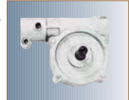
Custom Worm Gear Reducers