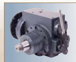
Custom Helical Gear Reducers